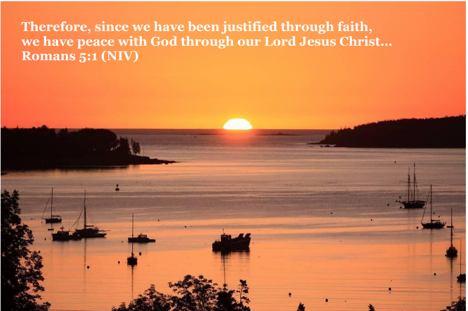
Sunset in Lubec

Therefore, since we have been justified through faith, we have peace with God through our Lord Jesus Christ... Romans 5:1 (NIV)