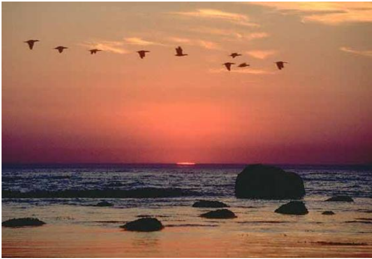
Wells Beach at sunrise

HOLY CROSS LUTHERAN CHURCH AUGUST 2017 – PART I