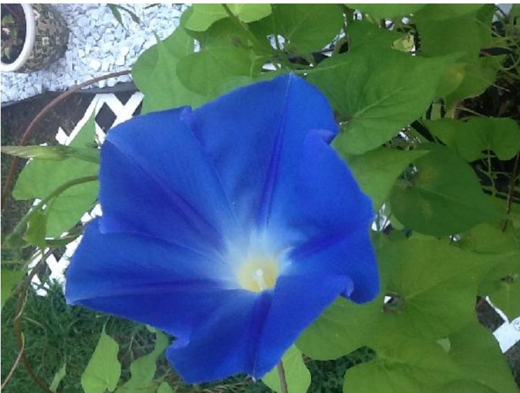
Mary Keating's Garden

The menu for this meal is still undecided but as usual, it will be delicious!