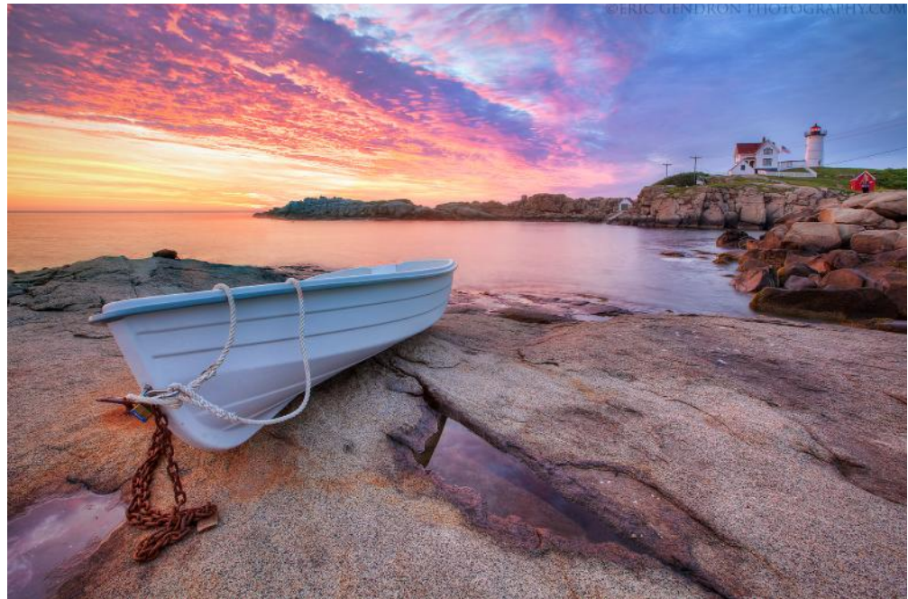
Nubble Light at sunrise